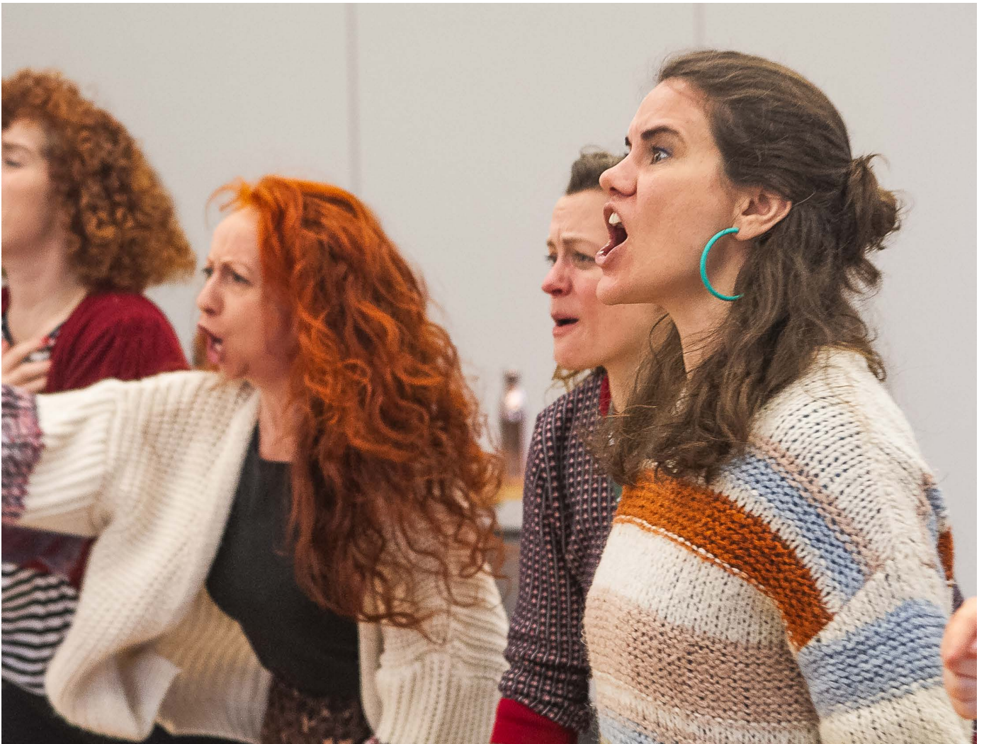
Angel Exit Community Play (play readthrough)