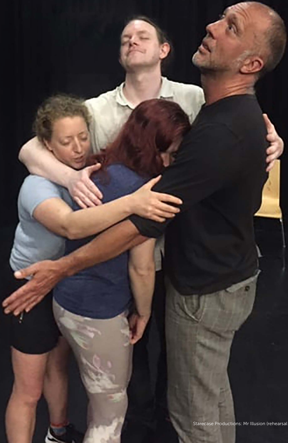
Starecase Productions: Mr Illusion (rehearsal image)