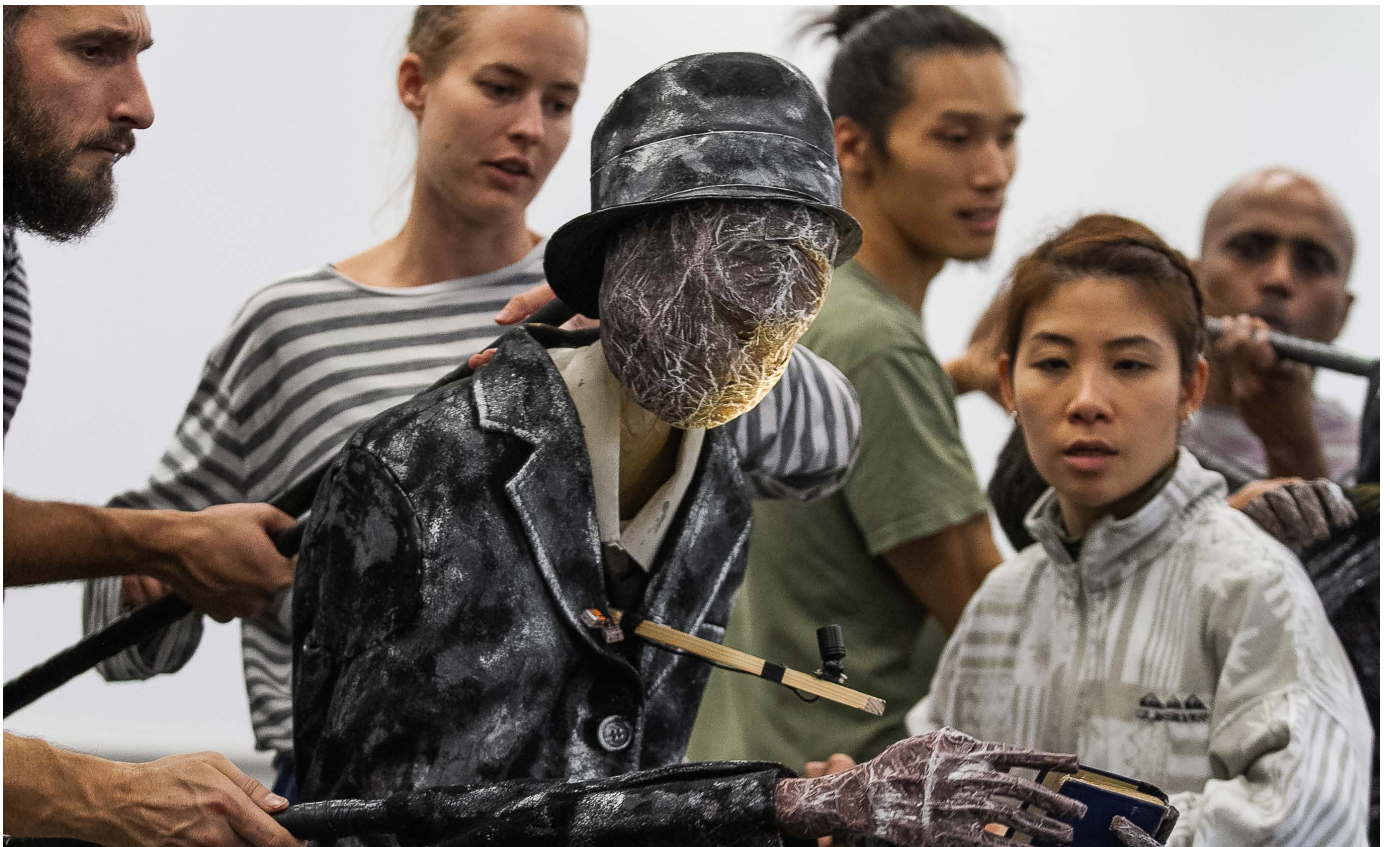
Gecko: Kin (rehearsal image)